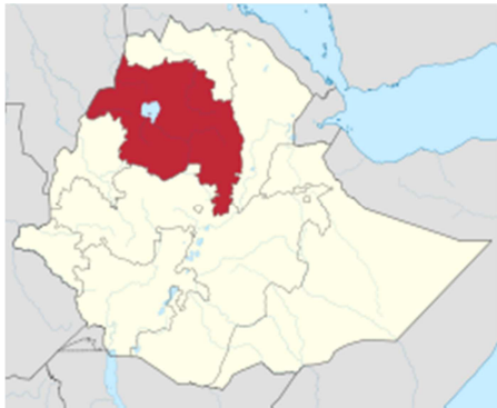
Figure 2. Ethiopia (the study area is shaded by red).